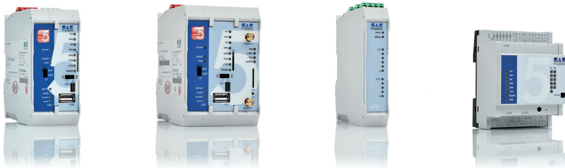
The most important basic devices for our renewable energy solutions (from left to right): FW-5-GATE, FW-5-GATE-4G, VPP-1 expansion module, m5